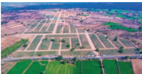
Grand Oaks-Bibinagar Phase 1