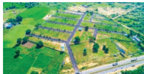
Silver Brooks-Bibinagar Phase 2